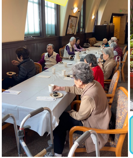
Eating Eho-maki (恵方巻) while facing southwest on Setsubun (節分) and making their wishes.