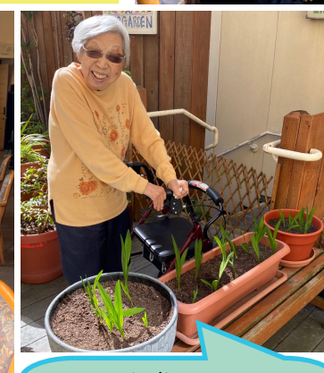
Freesia bulbs are growing each day. Can't wait to see once they have blossomed!